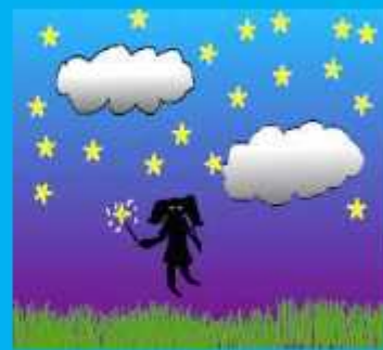
A Fly in the sky